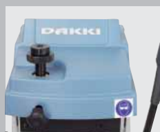
1. Semi automatic tracer for setting up