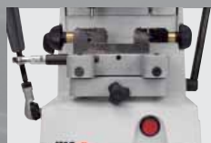
3. Upright movement blocking system