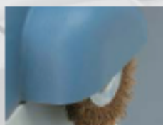
3 Brush incorporated