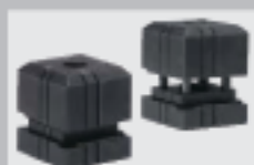
1.4 way hard steel jaws

automatic duplicating machine for flat keys for cylinder, automobile locks, cruciform and especial keys.