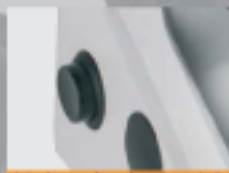
4 independent brush switch